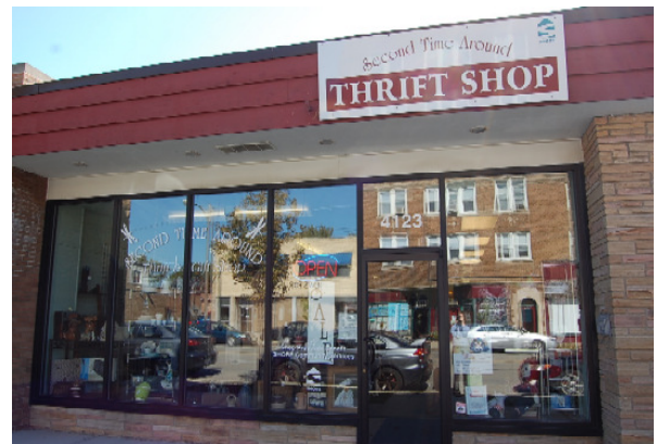
Second Time Around Thrift and Gift Shop 4123 Oakton Street in Skokie.